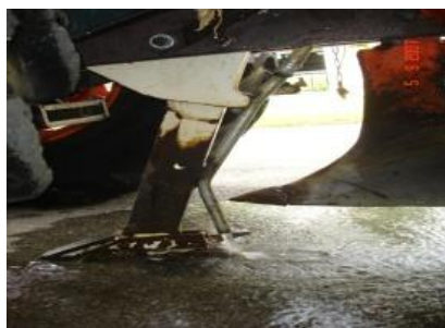
(a) Subsoiling and liquid fertilizer tube