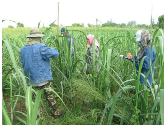
(C) Onsite measurement of the crop