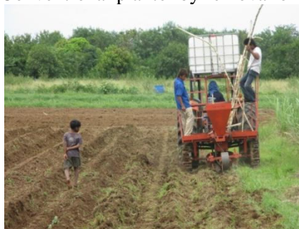
(c) Onsite mechanical action under covered residue in the field