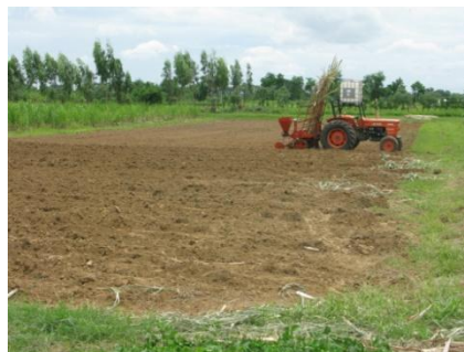
(b) Conventional planter by removal of subsoiler