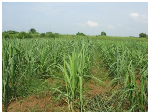
(b) The growth of the crop at 90DAP at RTAF