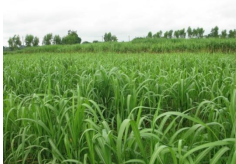
(a) The growth of crop after 90DAP at NAMC

The growth of the crop has been measured in the field at 90DAP as represented in Fig. 2. Similar trend of the average growth between both experimental sites with different of seeding depths (75, 100mm) have been shown in Figs. 3-4.