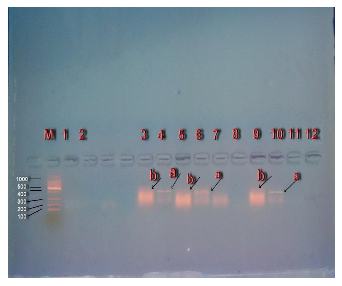
Figure 2: Detection of NPM1 A mutation using ASO-RT-PCR in AML patients.

Lane 3: amplified product from ABL gene of AML patient (arrow b app, 200 bp), lane 4: amplified product from NPM gene of the same patient shows a band app. 320 bp of type A mutation (arrow a).Lanes 5& 6: amplified product from AML patient ABL & NPM genes, respectively shows a mutant band in lane 6(arrow a).Lanes 7& 8: amplified product from a healthy control shows a band in lane 7 only of ABL gene. Lane 9& 10: amplified product from positive control OCI-AML3 cell line shows a band of ABL gene(arrow b) and a mutant band in lane 10 (arrow a). Lane 11: negative control (no template) for ABL gene mix. Lane 12: negative control for NPM1 gene mix. M: Molecular weight marker. (DNA ladder).Electrophoresis is carried in 2.5% agarose gel at (4V/cm) for 120min.