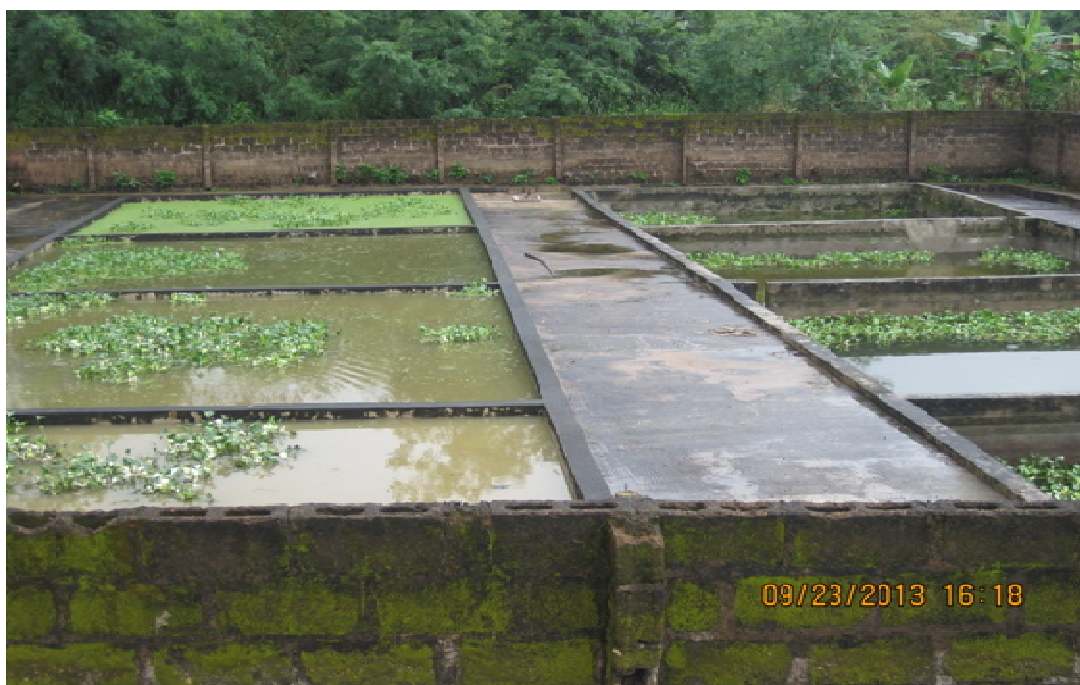
Figure 1 A: The Awba Lake (Above) and the Nearby Water Hyacinth Based Wastewater Treatment Plant Figure 1 B: Plan View of the Water Hyacinth Based Wastewater Treatment Plant