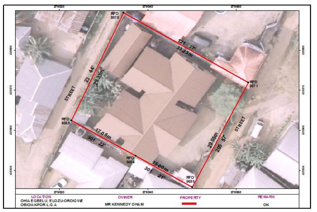
Fig 3: Plan No.: JWA/RV061/2000 Overlaid on the 2005 Orthophoto Map of Rivers State