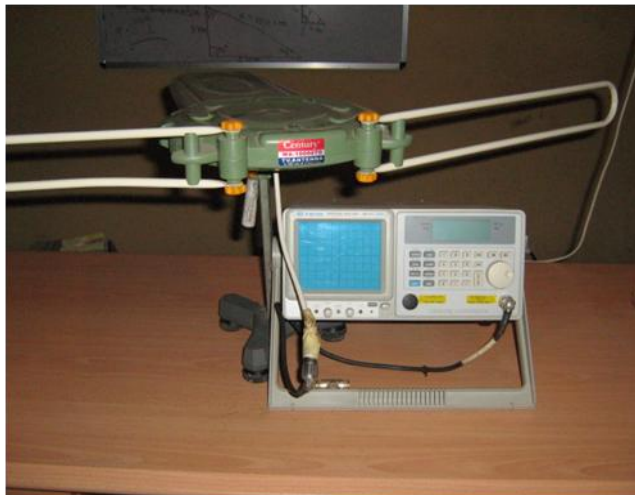
Figure 1: Experimental set up showing standard two rectangular folded array antenna employed in the measurements, and connected to the GSP 810 spectrum analyzer as the receiver.

It is evident from this study that the two formulas derived for antenna gain calculation can be adopted by the antenna designer as gain prediction formulas for the array antennas and general antennas as the case may be.