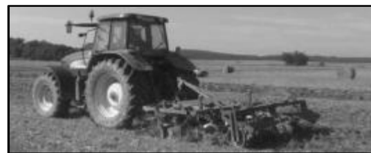
Figure 5: PöttingerSynkro field cultivator with non-series packing equipment