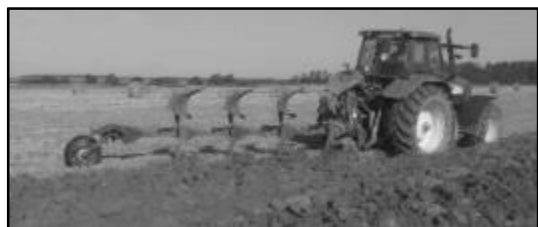
Figure 4: Vogel&Noot ©plus XM reversible plow