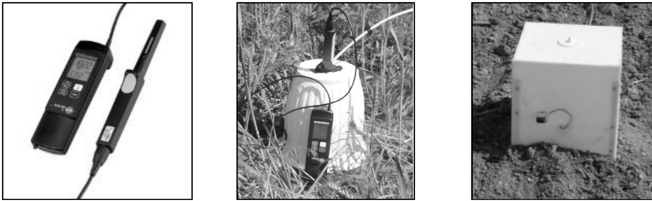
Figure 6: TESTO 535 CO 2 Tester and Portable Chambers