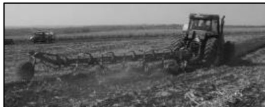
Figure 2: Kverneland BB 115 moldboard plow

d.) Small volume cylindrical shaped chamber with temperature measurement. Source: (Parkin and Venterea, 2010)