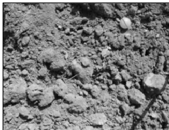
Figure 9. Surface aggregates after disc harrowing (1. measurement)