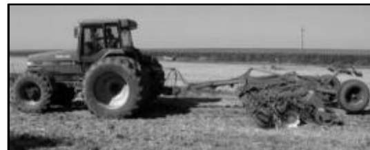
Figure 3: Kuhn Optimator compact disc harrow